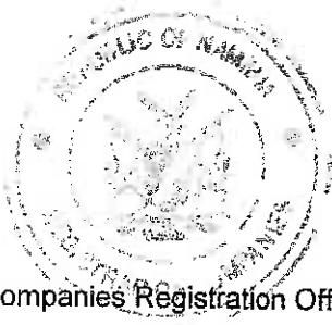
Seal of the Companies Registration Office

Signed and sealed at WINDHOEK this 24 day of April of the year 2012